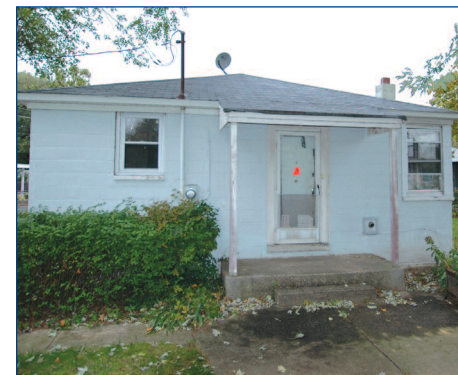
5600 Truman Street, Green Lawn Park