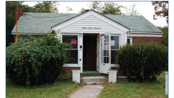
2300 Airacobra Street, Bloomsdale-Fleetwing